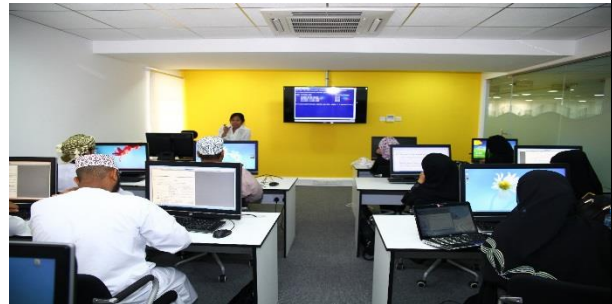
IT Training classroom